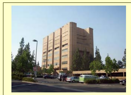
El Cajon Courthouse

Please see Law Library on page 9 for list of wireless resources available free of charge